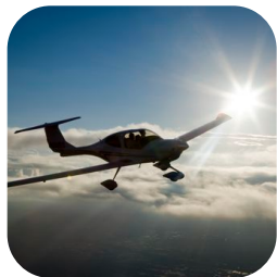
Diamond DA40 2004 DA40

"Steam gauge" DA40 with LOW time and dual Garmin 430's, fresh annual and no damage history.