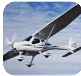
REMOS LSA 2010 Demonstrator

Special Sale this month under $1749 per month