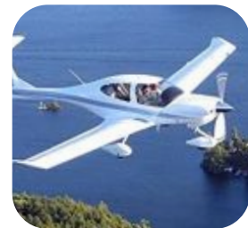
Acres of Diamonds 2004-2010

Special Sale this month Only $792 per month