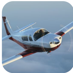
Mooney Ovation M20R Ovation2 GX

Enjoy speed , efficiency and the wonders of the Garmin G1000 panel with WAAS, GFC700 autopilot, SafeTaxi, Stormscope, Chartview and more!