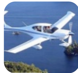
Acres of Diamonds 2004-2010

Special Sale this month Only $792 per month