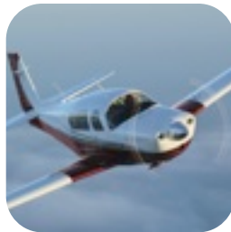
Mooney Ovation M20R Ovation2 GX

Enjoy speed , efficiency and the wonders of the Garmin G1000 panel with WAAS, GFC700 autopilot, SafeTaxi, Stormscope, Chartview and more!