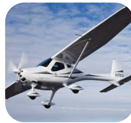
REMOS LSA 2010 Demonstrator

Special Sale this month under $1749 per month